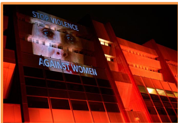
The Palais de l'Europe in Strasbourg, France was lit orange in a Council of Europe ceremony in response to the UNiTE campaigns call to orange the world.

All women and girls survivors of violence require access to multi-sectoral services, including health, police and justice, and social services, for their immediate and ongoing safety, health and recovery. Health services are essential as, amongst other things, they provide survivors with immediate treatment and care for injuries; treatment and medication for possible exposure to HIV through the provision of Post Exposure Prophylaxis (PEP), as well as for other sexually transmitted infections (STI); forensic medical examinations or rape kits in case the survivors decide they would like to report and pursue justice; access to emergency contraception and, where it is legal and safe, access to abortion if relevant; as well as counselling or psychological support for immediate emotional / psychological health needs. Although progress is being made globally, many women and girls survivors still lack access to adequate and appropriate multi-sectoral services. The existing services are typically underfunded, understaffed, not of sufficient quality and mostly available in big cities. Vulnerable groups—such as migrant women, women living with disabilities, indigenous women, older women or women living in remote areas who are often more at risk of such violence - have even more limited options and often lack access to basic services. Stigma, lack of confidence in the quality of services or lack of awareness also prevent survivors from accessing services.