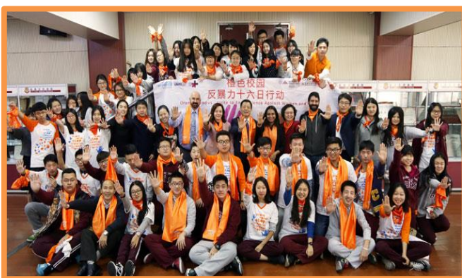
Students at Beijing Normal University and Beijing Royal School wore orange to spread messages on ending violence against women.

SDG 3 includes a target to end the epidemics of AIDS, among other communicable diseases, by 2030. This target cannot be achieved without ending another pandemic, violence against women and girls. Violence is one of the key drivers behind the increasing number of women and girls living with HIV and AIDS. Sexual violence puts women at