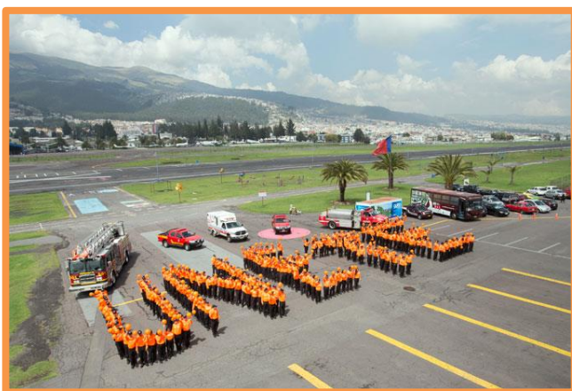
Firefighters in Quito, Ecuador, call for everyone to become part of the "Orange the world" effort to end violence against women by spelling out the word UNiTE ("Unete" in Spanish).

The United Nations Secretary-General's Campaign UNiTE to End Violence against Women has proclaimed the 25 th of each month as "Orange Day", a day to raise awareness and take action to end violence against women and girls. As a bright and optimistic colour, orange represents a future free from violence against women and girls, for the UNiTE Campaign. Orange Day calls upon activists, governments and