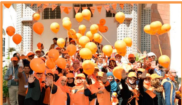
As part of the 16 Days of Activism against Gender-Based Violence, UN Women in Yemen organized an event to orange the world. Participants released orange balloons with messages of freedom from violence for women and girls.

Sustainable Development Goal 3: Ensure healthy lives and promote well-being for all at all ages SDG 3 recognizes the interdependence of health and development, and aspires to ensure health and well-being for all. It includes a bold commitment to end the epidemics of AIDS, among other communicable diseases by 2030. It aims to achieve universal health coverage, including access to quality essential health-care services and access to essential medicines. It also calls for a substantial increase in health financing and the recruitment and training of health workforce in developing countries.