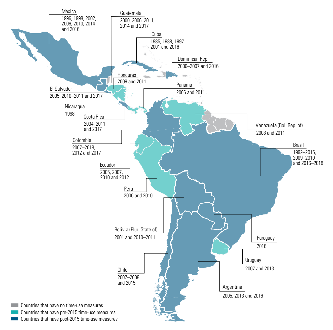
Map IV.1 Latin America: surveys, modules or questions for measuring time use, 1985–2018