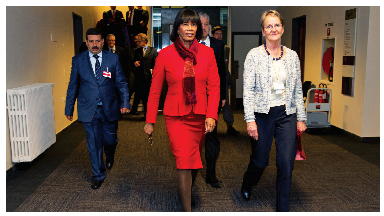
Portia Simpson Miller, Prime Minister of Jamaica, during her arrival to Geneva to participate of the 50th Anniversary of UNITAR.