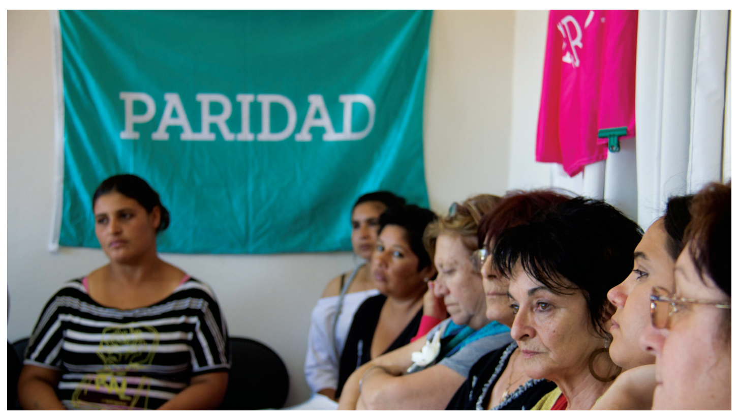
Meeting of women for parity in Uruguay.