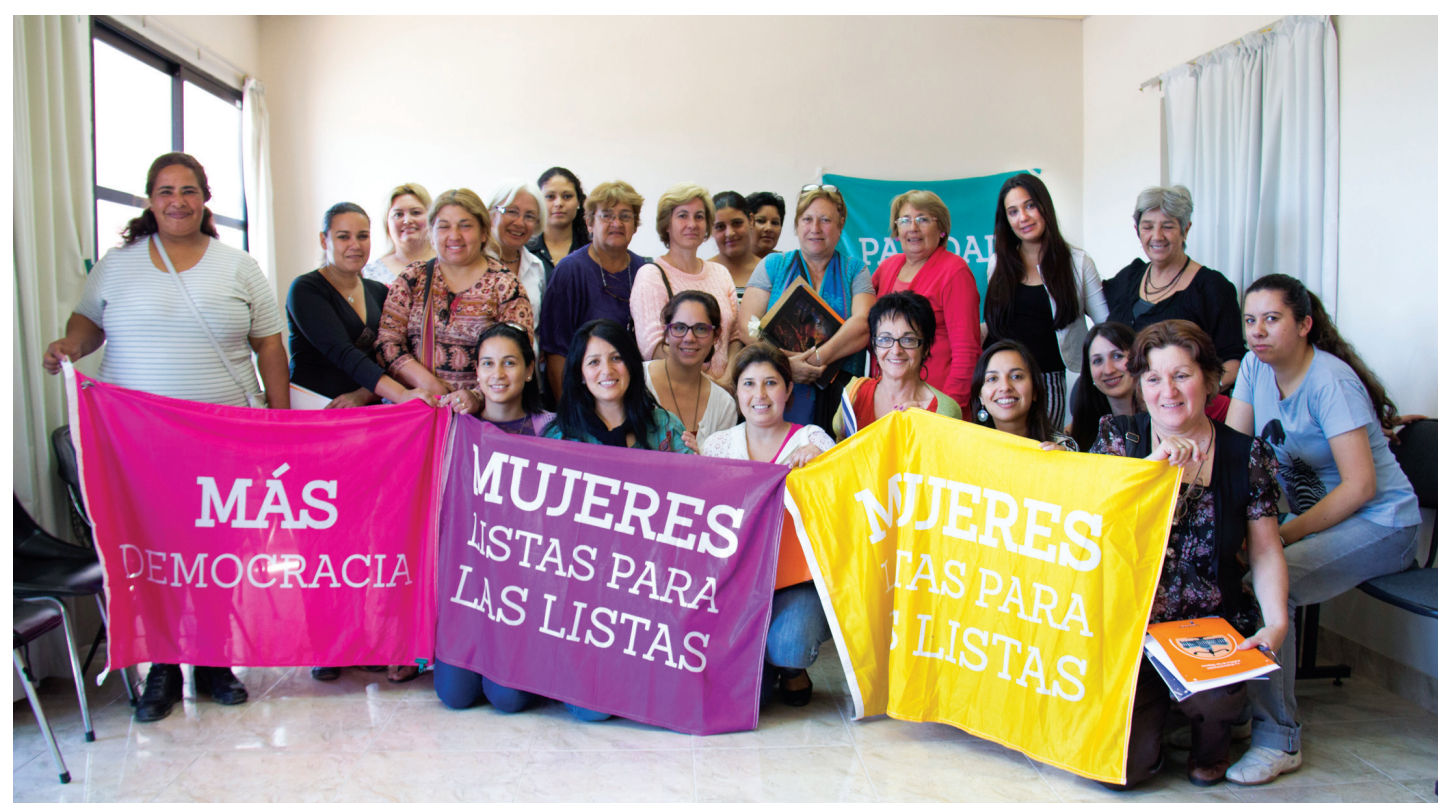
Meeting of women for parity in Uruguay.