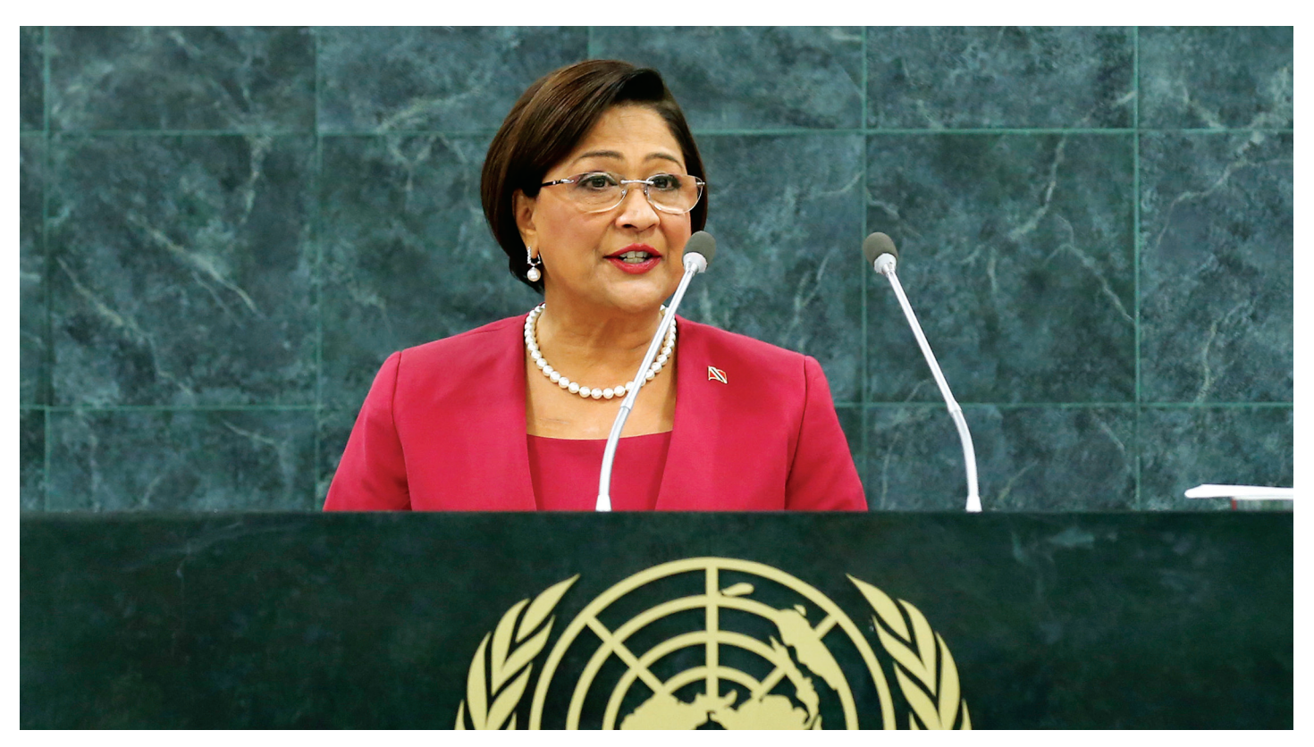
Kamla Persad-Bissessar, Prime Minister of Trinidad and Tobago, addresses the general debate of the 68th General Assembly of the United Nations.