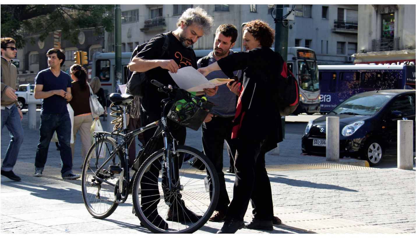
Collection of signatures for parity democracy in Uruguay, organized by Cotidiano Mujer, CIRE and CNS Mujeres, and supported by UN Women.