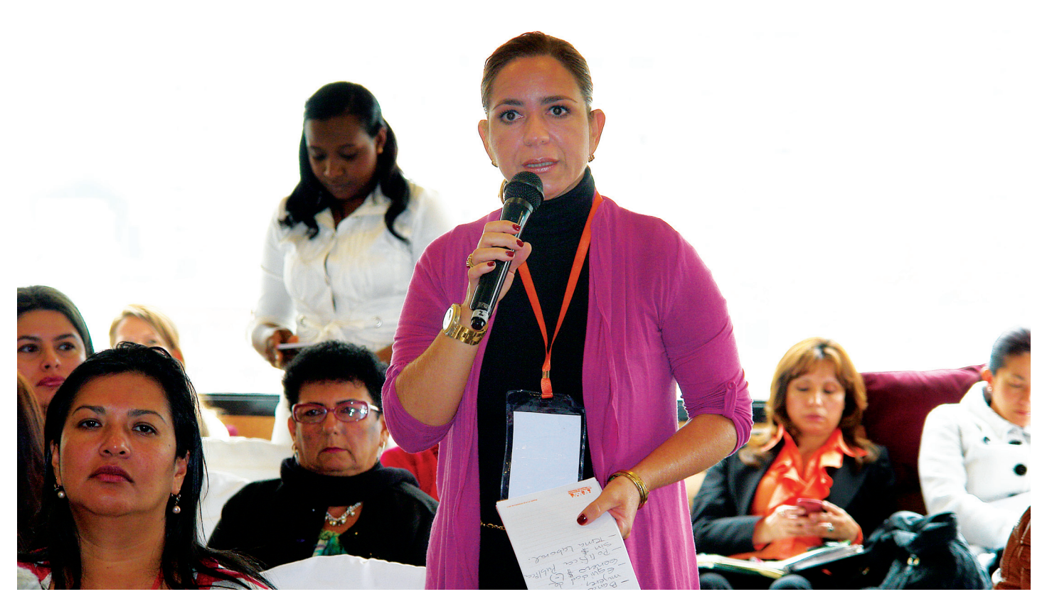
National Summit of Women Elected in Colombia organized by the Ministry of the Interior, UNDP, UN Women, International Cooperation Gender Group, NDI and IDEA International.