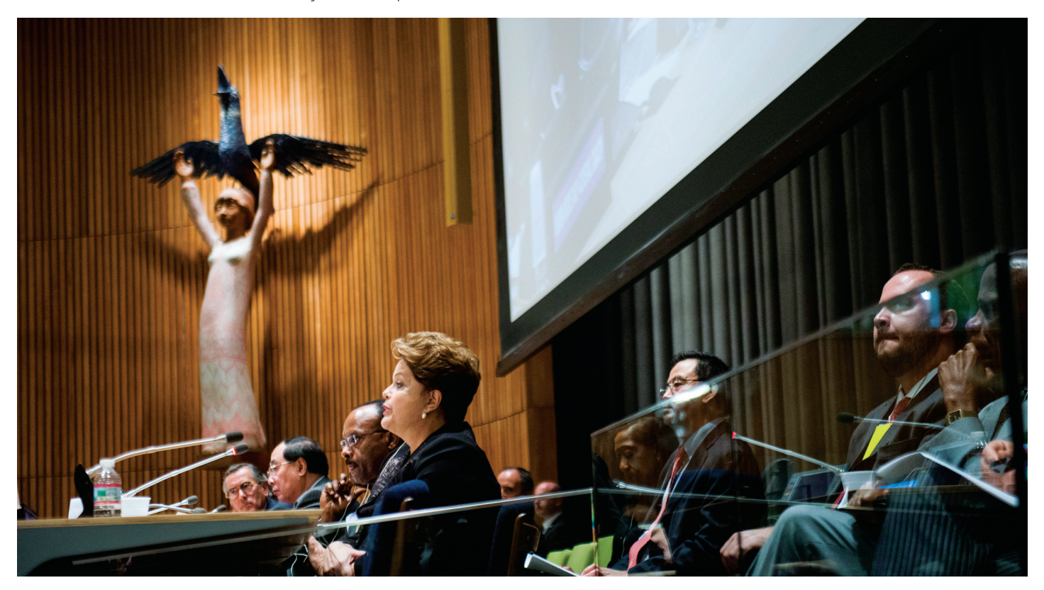
Dilma Rousseff, President of Brazil, addressing the participants during the inauguration ceremony of the High Level Political Forum on Sustainable Development.