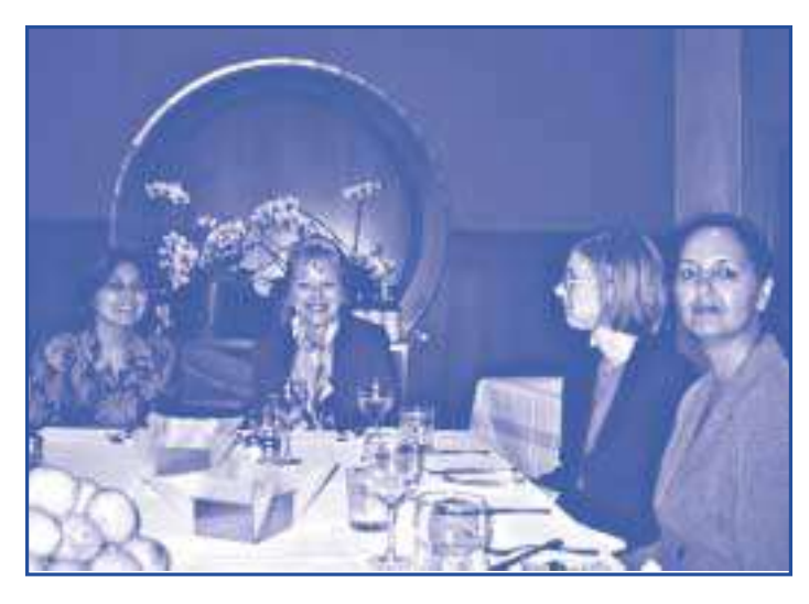
ORIGIN meeting, Toronto, Canada, 13-14 June 2002