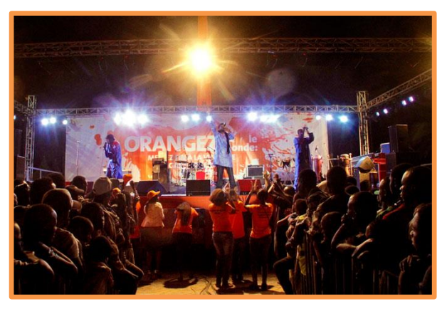
Singers perform during the kick-off of the 16 Days to Activism against Gender-Based Violence in Dakar, Senegal.