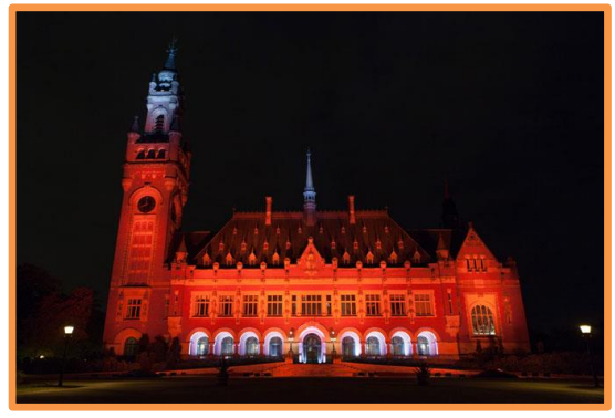
The Peace Palace in The Hague, Netherlands, was lit in orange on 24 October 2015.

Please share your plans and help us show how we are "oranging" the world. Throughout the 16 Days and as some iconic buildings will be lit in orange and each country will organize its "orange"-related activities, we will light the country in orange on our "Orange Map of the World".