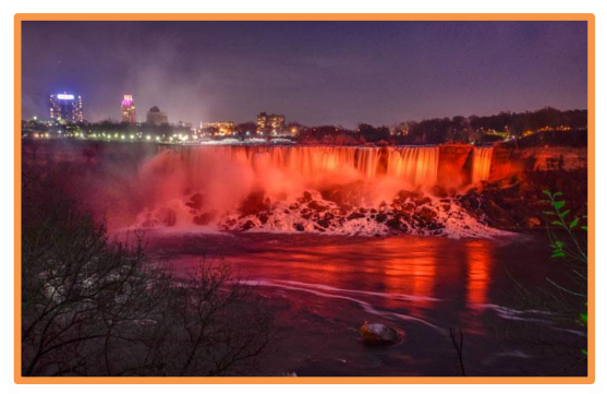
Niagara Falls, both American and Canadian Horseshoe falls, bathed in orange light on 24 November 2015.

The 16 Days of Activism Against Gender-Based Violence is an international campaign which takes place each year and runs from 25 November ( International Day for the Elimination of Violence against Women ) to 10 December ( Human Rights Day ), also encompassing other important key dates. Widely known as the "16 Days Campaign", it is used as an organizing strategy by individuals and organizations around the world to call for the prevention and elimination of violence against women and girls. It was originated by the first Women's Global Leadership Institute in 1991 and is coordinated by the <u>Centre for Women's Global Leadership</u>.