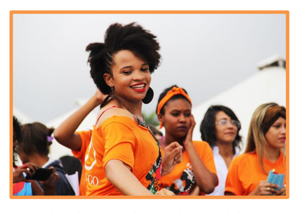
Women dressed in orange take part in the March of Black Women against Violence and Discrimination in Brazil.

However, despite the international community's visible interest and political will to address the global pandemic of violence against women and girls, there is still a lack of adequate and sustained resources to translate the national efforts into effective programmes and practices that make positive changes in the lives of women and girls. The gap between binding commitments, laws and policies in place and the lived experiences of women and girls who should