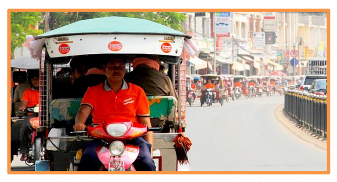
Over 50 tuk-tuks taking part in the Orange Day parade in Phnom Penh.

• Consider organizing events outside "usual" spaces for activism. Explore for instance the possibility of organizing activities outside capitals in smaller towns or rural areas and reaching out to new audiences by organizing activities in spaces such as sports clubs, places of worship,