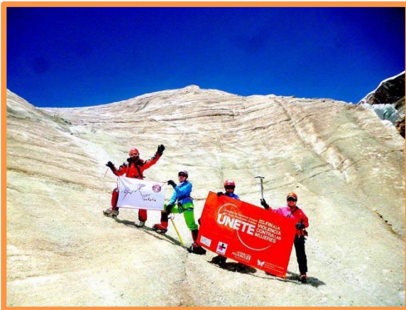
Women's organizations and women from all over Bolivia organized a hike to the Nevado Huayna Potosi glacier, near La Paz in northeast Bolivia during the 16 Days of Activism against Gender-Based Violence. They left their footprints on the glacier to show their determination to end violence against women and girls.

The United Nations Secretary-General's Campaign UNiTE to End Violence against Women has proclaimed the 25 th of each month as "Orange Day", a day to raise awareness and take action to end violence against women and girls. As a bright and optimistic colour, orange represents a future free from violence against women and girls, for the UNiTE Campaign. Orange Day calls upon activists, governments and UN partners to mobilize people and highlight issues relevant to preventing and ending violence against women and girls, not only once a