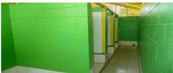
Women public toilets of the Gerehu market after refurbishment.

There are a number of examples of programmes which seek to address violence against women and girls in the context of accessing water and sanitation, including the following: